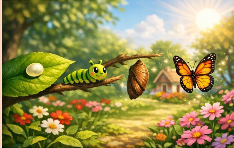
Ti-Papillon dan Zardin Mamie

Dan zardin Mamie, enn ti-dizef ti pe repoze trankil lor enn fey. Apre enn tigit letan, li vinn enn ti-seni, li avanse dousman e li get tou keksoz avek kuryozite. Kan li santi li fatige, ti-seni la anvelop li dan enn kokon e li reste trankil ek pasian. Enn zour, kan soley klere bien for, kokon la ouver e enn zoli papillon sorti, li vole partou dan zardin Mamie e anmenn lazwa ek lespwar.